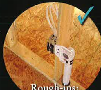
Rough-ins: Central vac, security, phone, cable, future 3 pc. in basement