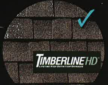
Lifetime Ltd. Warranty GAF shingles