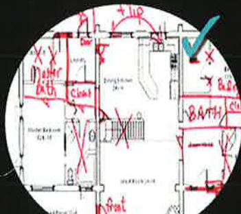
This is your home. If changes are feasible, consider it done.