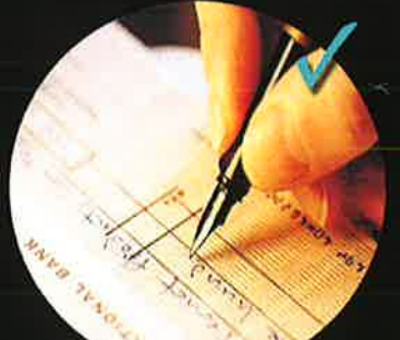
$5,000.00 deposit with Offer to Purchase

We took your favorite upgrades and made them our STANDARDS.