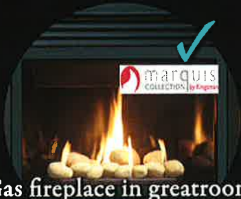
Gas fireplace in greatroom with river rocks, crushed crystals or logs.