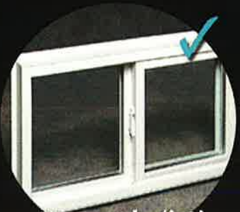
Extra wide 4'x3' basement windows