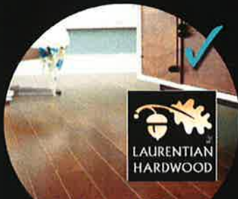
Hardwood floors in greatrooms