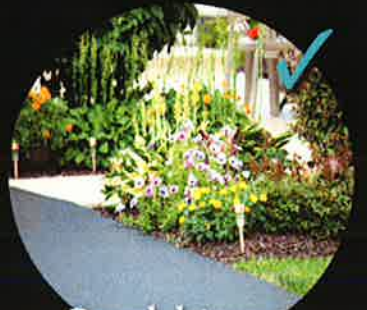
Paved driveways and fully sodded lots