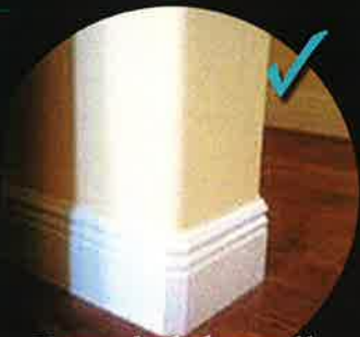
Rounded drywall corners 'optional'