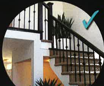
Wrought iron spindles and oak handrails